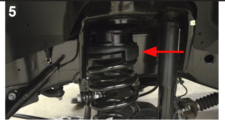
Install coil springs and Spacer back into vehicle, and raise the axle while guiding coil springs into place. Make sure the spring is orientated the same way as when it was removed.