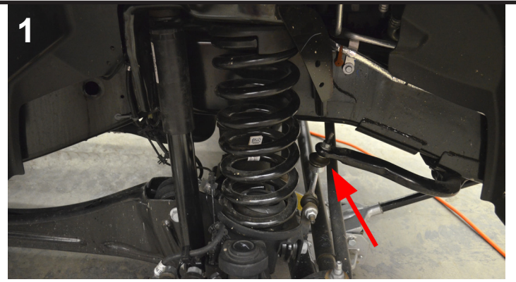
Raise the truck with a jack and place on jack stands at the chassis. Remove wheels and tires. Disconnect sway bar link at the sway bar on both sides.