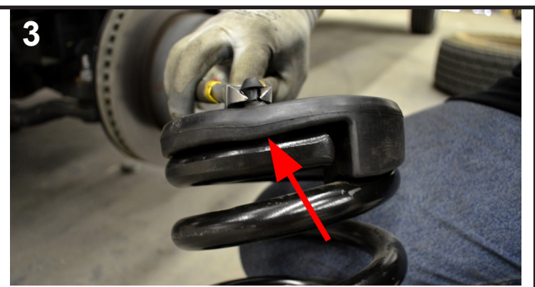
Remove the coil spring and rubber spring isolator from the vehicle. Cut the nipple off of the rubber spring isolator.