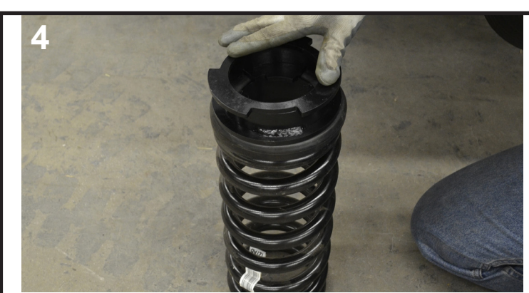
Re-install the isolator onto the spring, and mount the Traxda Coil Spacer above it. Repeat steps 3 and 4 for other side of vehicle.