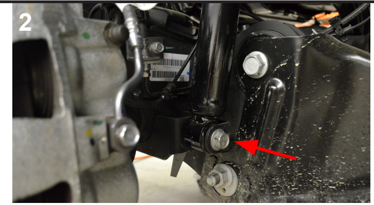
Disconnect the front shock absorbers at the axle mounts on both sides. Carefully lower the front axle using jack until the coil spring is loose.