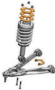
Figure A: Illustration is for reference only. Part dimensions will vary.