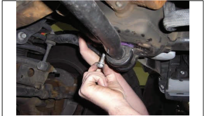
Remove sway bar mounting hardware at frame