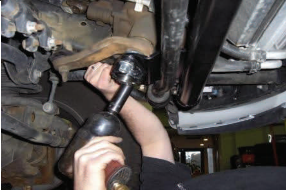
Attach locator bearing over sector shaft extension