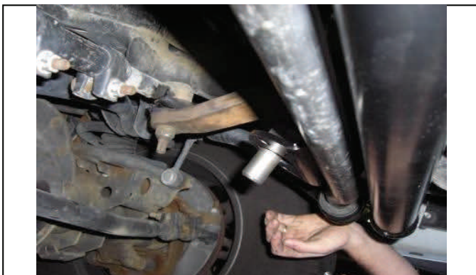
Place new stabilizer bar into position and raise sway bar