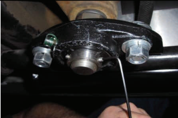
Attach bearing retainer and tighten set screws

Now test the vehicle by steering completely lock to lock and check for any interference or binding issues. Recheck all work and perform test drive.