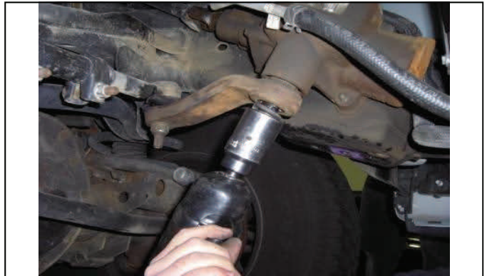
Remove pitman arm mounting nut