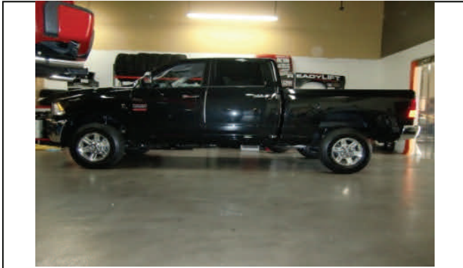
Position vehicle on level ground with steering wheel straight