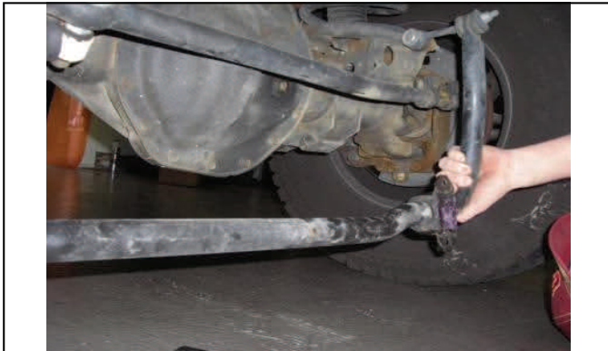
Lower sway bar and let hang as shown