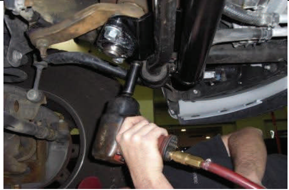
Tighten bearing and then sway bar hardware