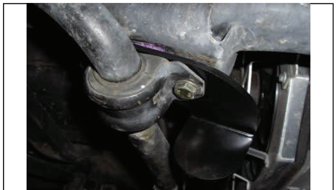
Start new hardware to reattach sway bar through bracket