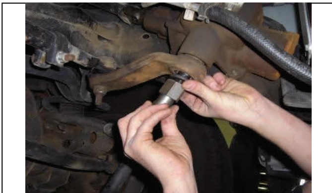
Place extension onto sector shaft with lock washer as shown