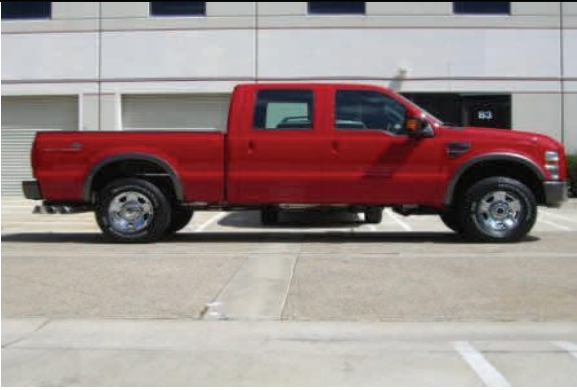
Position vehicle on level ground with steering wheel straight