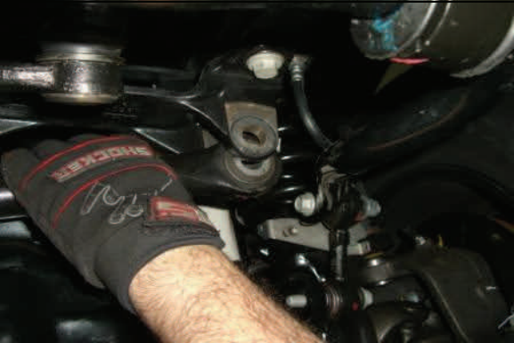
Pull down trac bar or use pry bar to disconnect