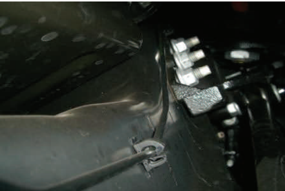
Remove (3) mounting nuts on cross member

Remove and replace bracket with new one in reverse order. It may be necessary to move the vehicle side to side in order to reattach trac bar in the new bracket. This can be done by starting the vehicle and carefully moving the steering wheel. Make sure to properly torque all hardware to factory spec. Have vehicle aligned.