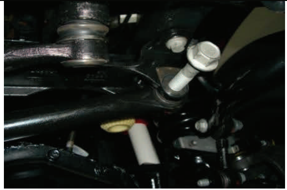
Remove upper trac bar hardware at frame