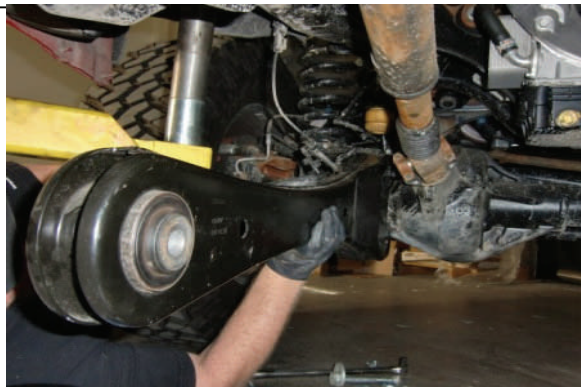
Lower slowly & remove front radius arm hardware and arms