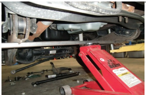
Block front wheels, use a jack w/crossbar to support arms