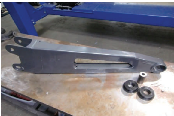
Photo shows one side Stage 2 radius arm and bushing kit