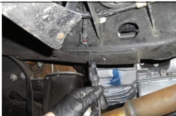
Disconnect ABS line at plug above radius arms