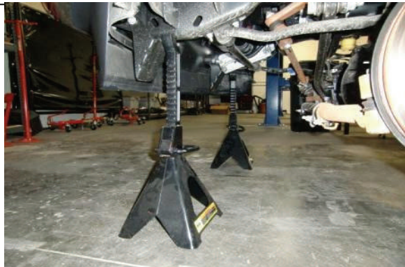
Support weight of the vehicle by frame. Min. 3 ton jacks