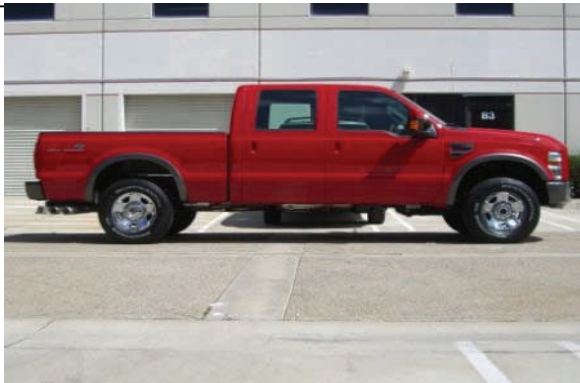
Place vehicle on level ground Leave wheels/tires on vehicle