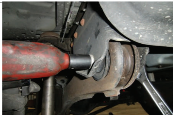
Loosen and remove bolts at rear of dr./pass. radius arms