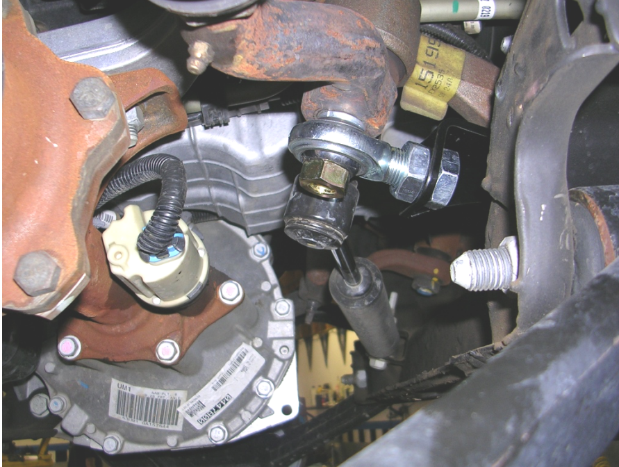
Figure 3: idler arm bracket installed