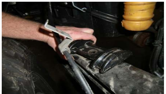
11. Remove upper u-bolt mounting plate and overload spring.