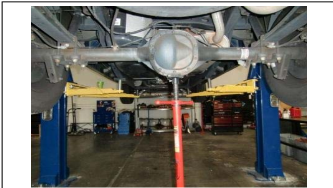
1. Raise vehicle at frame and support axle with jack.

The Bill of Materials represents the component contents of this kit. All hardware is of the highest grade and the components are manufactured to exacting specifications for a trouble free installation. Use the attached torque specifications chart when final tightening of the nut and bolts are done.