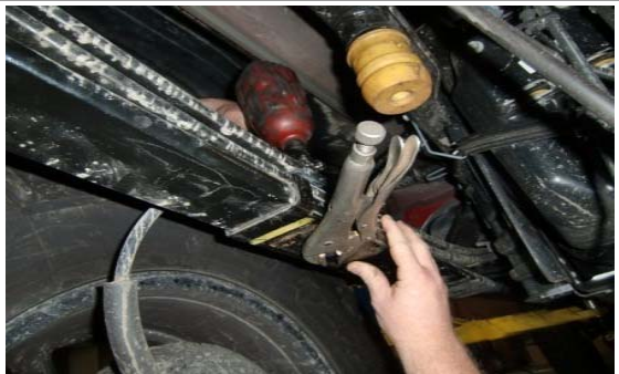
10. Clamp centering pin(s), loosen bolt supporting lower leaf.