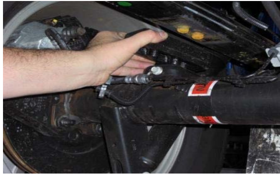
7. 4WD: Lower axle enough to remove factory block.