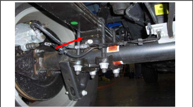
4. View of 4WD rear axle and leaf spring, note factory block.