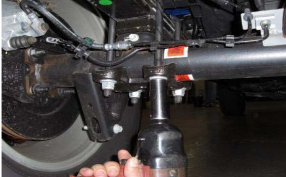
5. Loosen and remove factory u-bolt hardware.