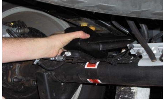
8. Install lift block if you don't have an Add-a-Leaf.

The next 7 steps (9-15) are for kits that include an Add-a Leaf. Note: The F150 will have two center pins and the F250/F350 uses only one.