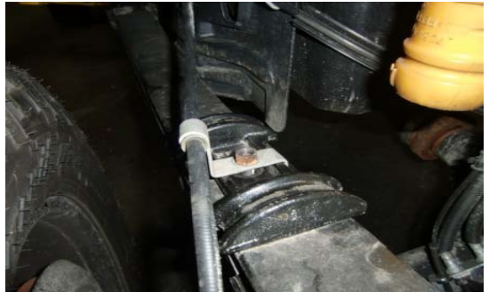
9. Remove e-brake bracket from upper u-bolt plate.

The next 7 steps (9-15) are for kits that include an Add-a Leaf. Note: The F150 will have two center pins and the F250/F350 uses only one.