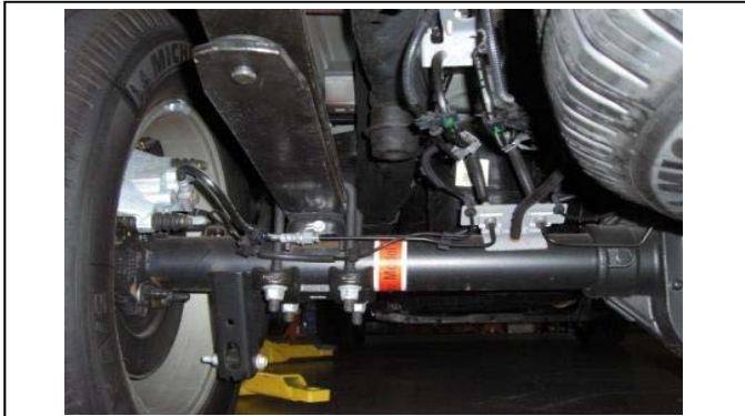
3. View of 2WD rear axle and leaf springs.