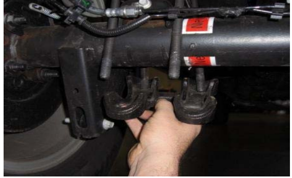
6. Remove lower u-bolt axle plate.