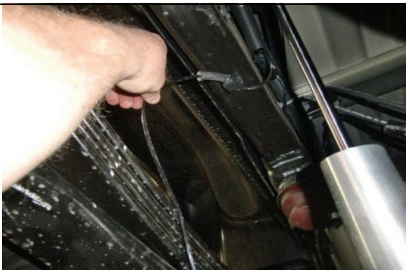
Slide ABS wire clip at frame up to gain slack to avoid damage