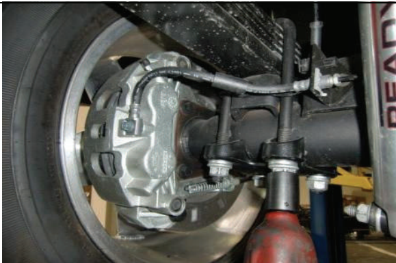
Support axle and remove U-bolt hardware and axle bracket