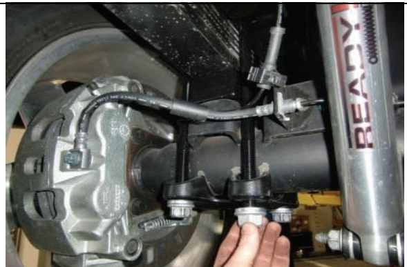
Raise axle aligning center pin and install new U-bolts/nuts.