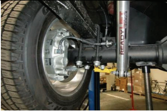
Raise and support vehicle on level ground and support frame.