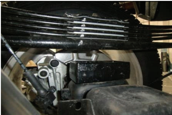
Note slight taper on block, shorter end towards front of truck