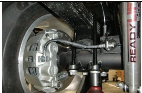
Torque U-bolts with vehicle on ground and re-clip ABS wire