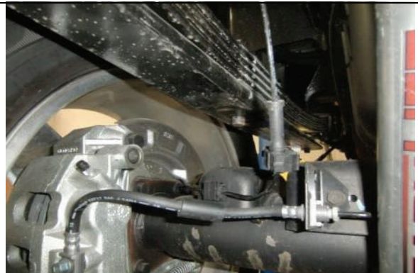
Remove U-bolts and lower axle to allow lift block positioning