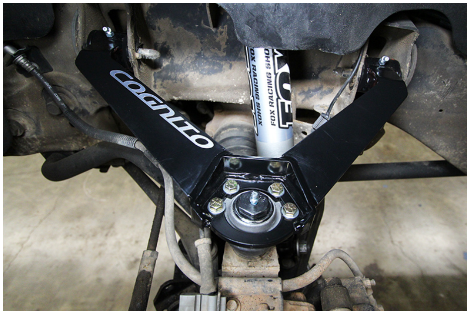
Figure 4: Passenger side Cognito control arm installed