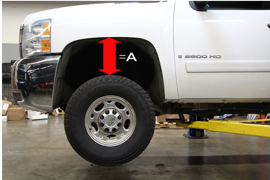
Figure 5: Distance between top of tire and fender lip.