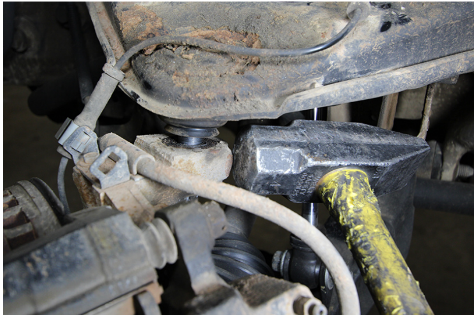
Figure 1: breaking ball joint loose from spindle