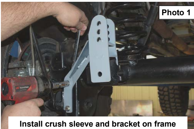
Install crush sleeve and bracket on frame