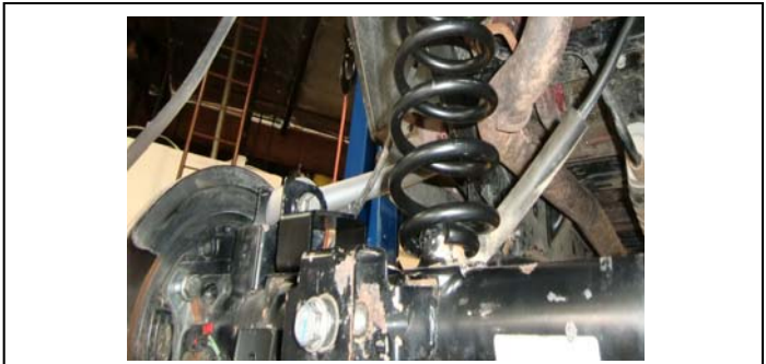
4. Axle ready for track bar bracket.