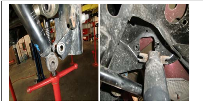
3. Remove the driver rear shock (Optional for clearance).