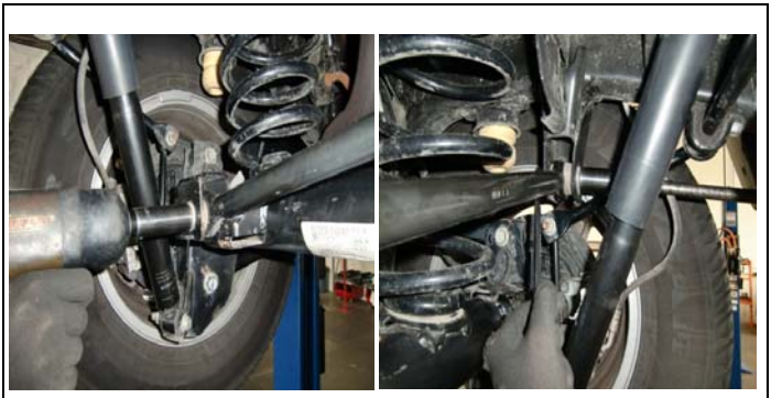
2. Unbolt and remove the rear track bar. Support the rear axle.