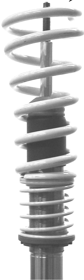
Installed coilover strut.

Insert the original supporting bearing and mount it with the supplied stop nut. Tightening torque for the piston rod is 35 Nm (26 ft-lb). The strut unit has to be installed according to manufacturers recommended settings regarding tightening torque and fixing specifications.