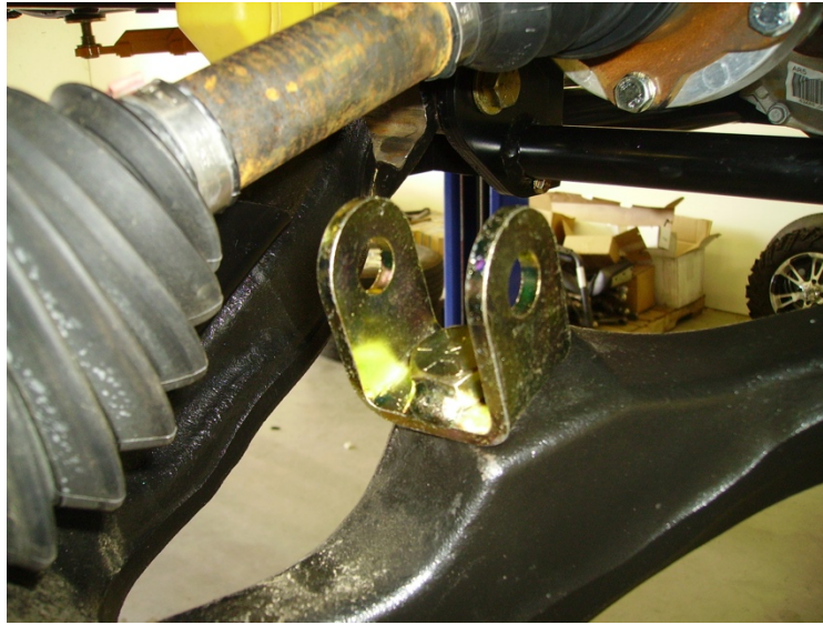
Figure 1: Clevis in lower a-arm, don't tighten yet.