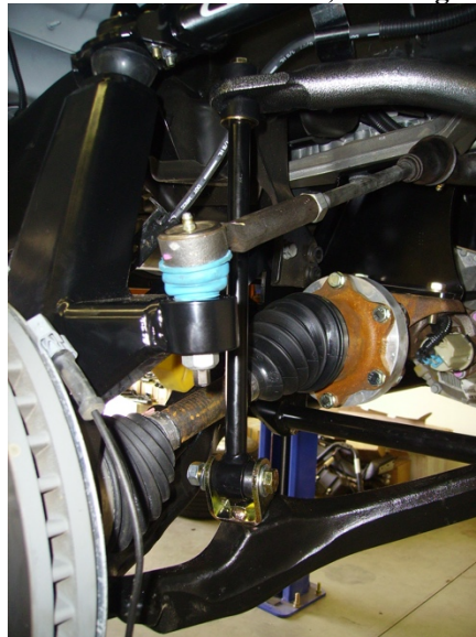
Figure 2: end link in place, clevis rotated so bushing relaxed, now tighten.