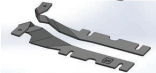
Mounting Brackets Only

* Simulated Rendering, NOT Actual Parts.