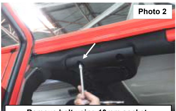
Remove bolt using 10mm socket.