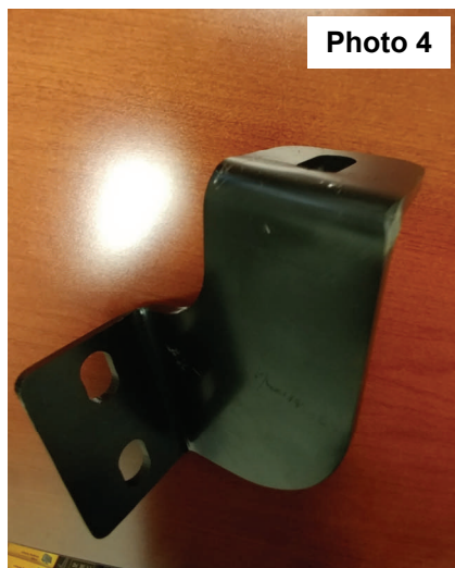
Passenger Front Lower Bracket