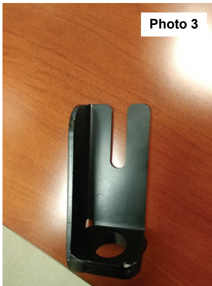
Passenger Front Upper Bracket