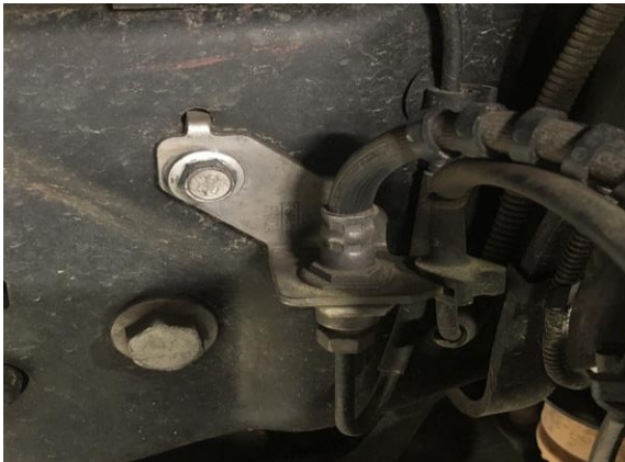
Figure 1A: OE Brake Line Bracket