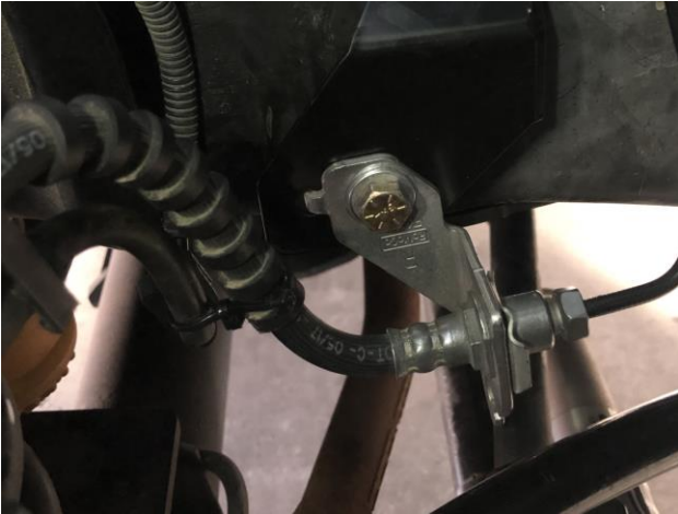
Figure 5: Diver Side ABS Line Installed