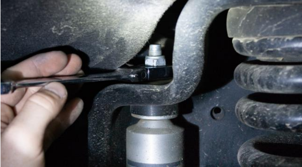
Figure 8A: Front Shock, Top Mount