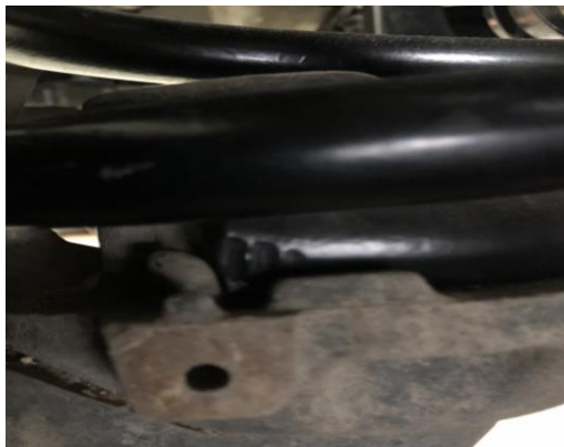
Figure 14B: Bottom Spring Pig-tail Orientation