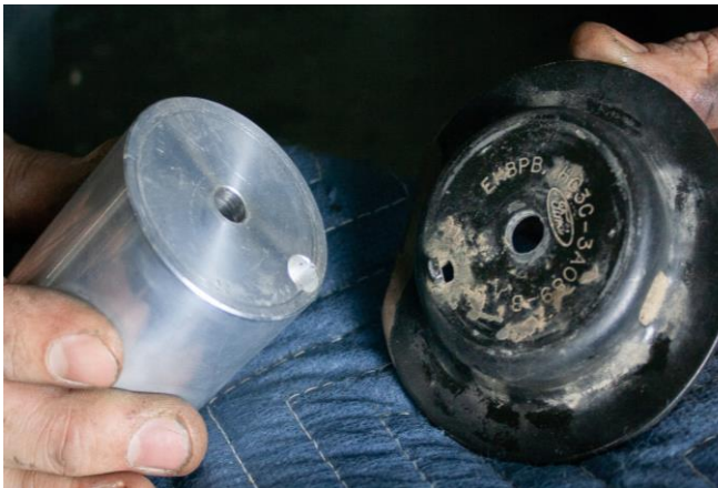
Figure 12: Bump Stop Spacer Alignment