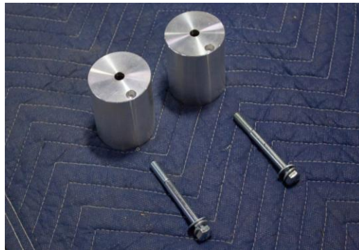
Figure 11: FSD Bump Stop Spacer Hardware