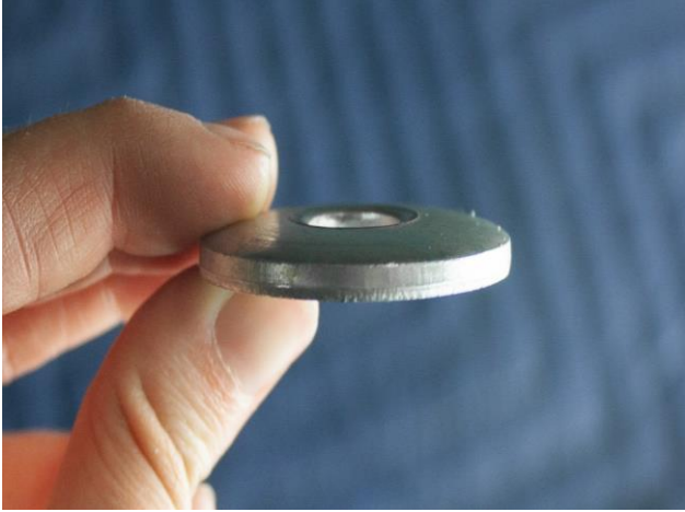
Figure 15A: Concave Shock Mounting Washer