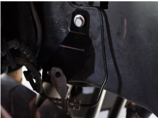
Figure 3: Passenger Brake Line Bracket