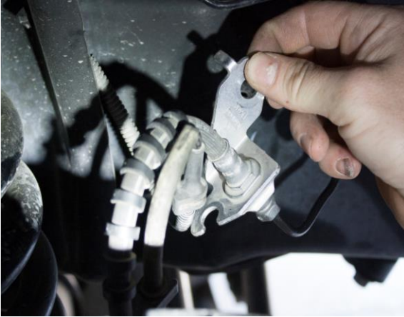
Figure 2A: Passenger ABS Line Removal