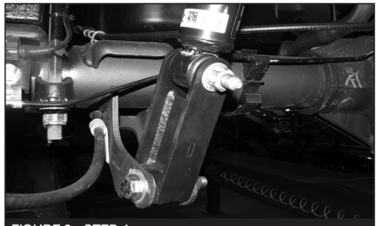
FIGURE 3 - STEP 4

4. Locate the supplied 1/2" hardware. Rotate the shock 90 degrees and install the new bracket to the factory lower shock mount. Torque to 127 ft-lbs. SEE FIGURE 3