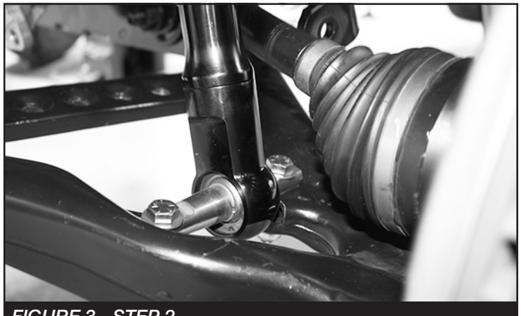
FIGURE 3 - STEP 2