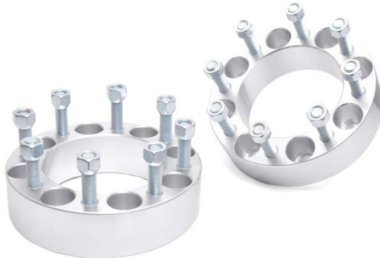
Part # 1094 1 1/2" Thick (6-5.5" PATTERN WHEEL SPACER SHOWN)