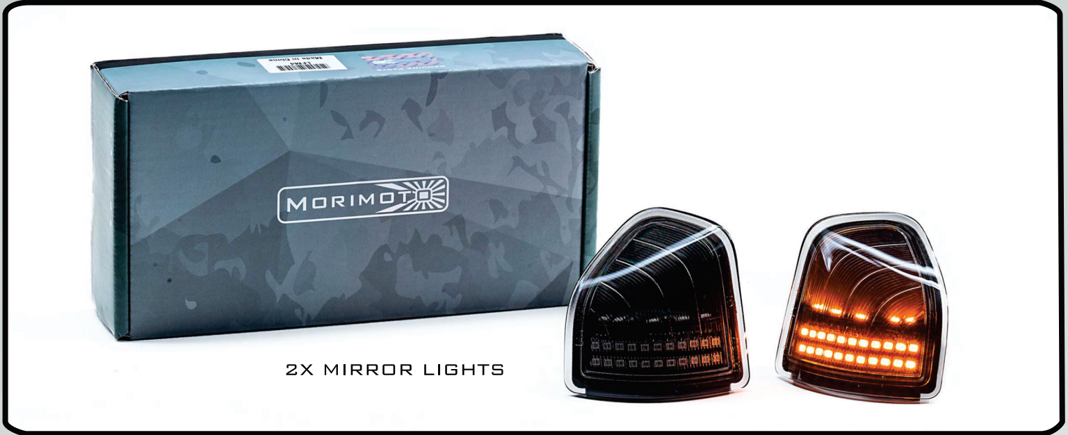
2X MIRROR LIGHTS