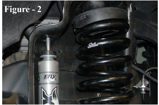
Figure - 2