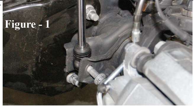
Figure - 1