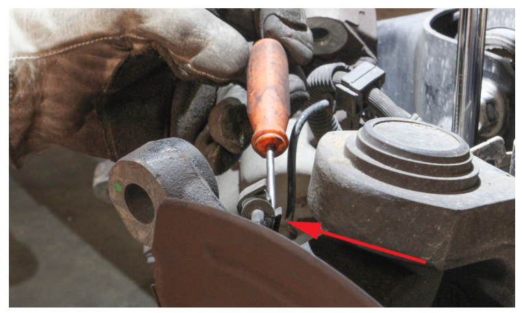
8. 5MM Allen - GENTLY Remove the ABS Sensor from the hub