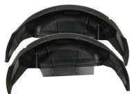
Driver Side & Passenger Side Liner 1 pr