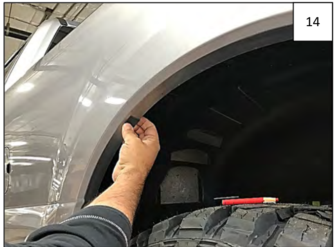
Peel liner from a supplied Foam Tab and center tab over each mark made in Step 12, folding each tab over the wheel well lip.