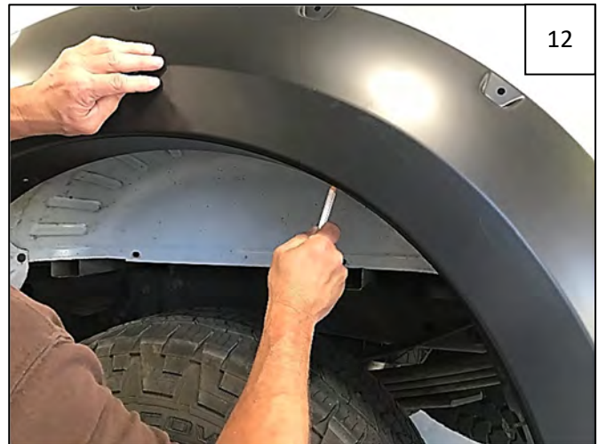
Align Rear Flare on fender using body style line and mud flap holes as a guide and mark 4 hole locations with a grease pencil.