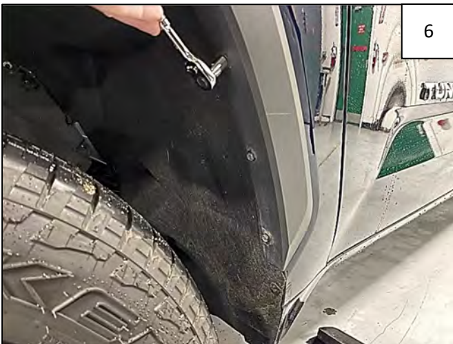
Using a 10mm socket, remove top bolt on rear of rear wheel well as shown.