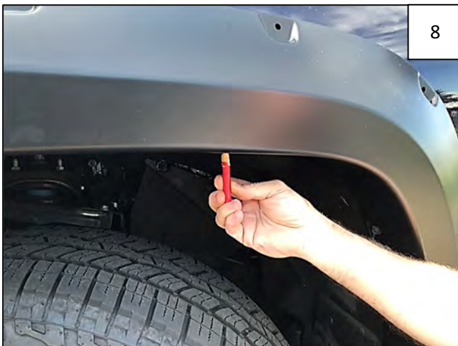
Hold flare firmly on fender and mark 2 top holes with a grease pencil.