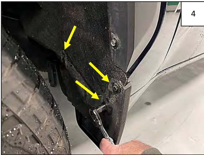
Using a 10mm socket, remove 3 factory fasteners from mud guard. Retain all screws for future use. NOTE: Some screws will not be used.