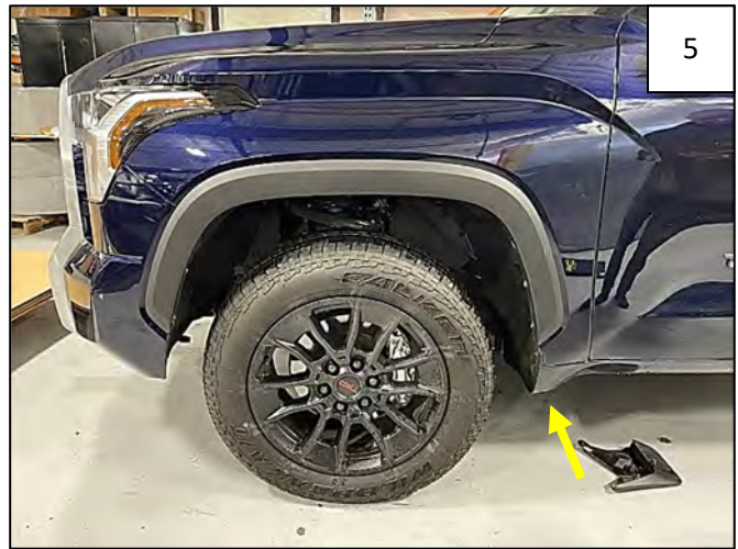
Using a 10mm socket, remove 1 factory fastener from underside of mud guard.