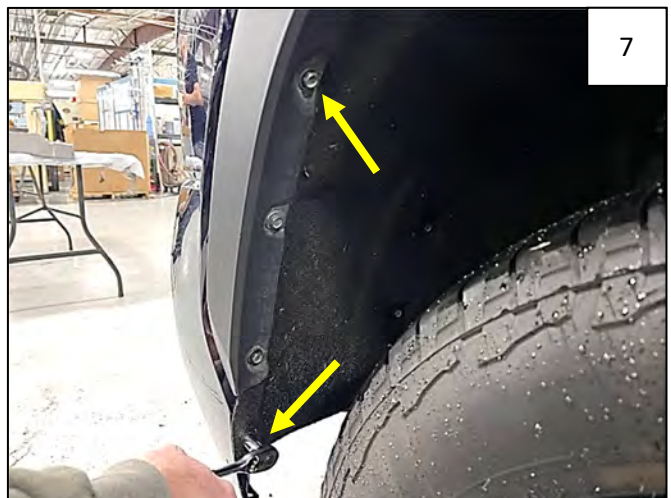
Using a 10mm socket, remove bottom and top bolt from front of wheel well as shown.