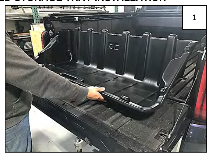
Pull down tail gate. Place Bed Storage Tray in bed, edge of tray aligning with edge of tail gate.