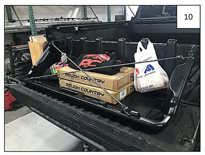
Criss-cross bungee cords to secure items.