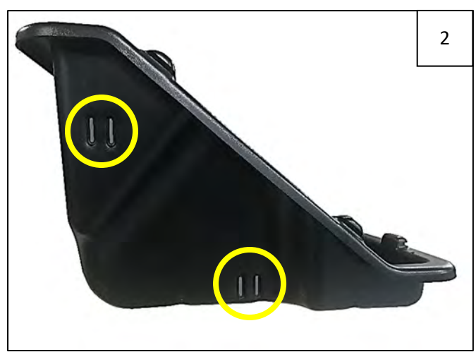
There are two pairs of slots on each end of the Bed Storage Tray. Locate the tie down nearest either the upper or lower pairs of slots – tie-down locations will vary by vehicle make and model.