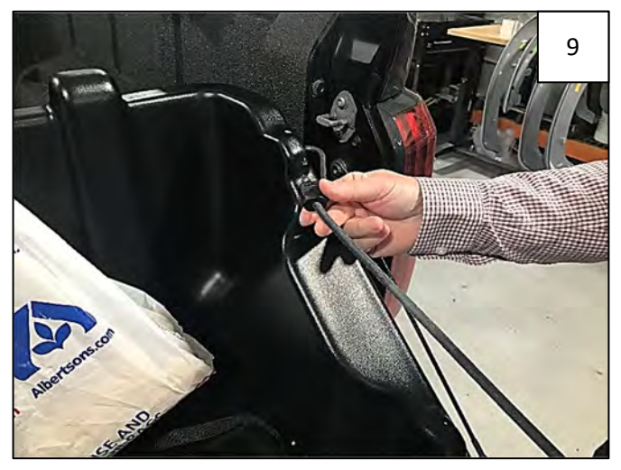
Use bungee cords (not provided) to secure items being stored in tray. Insert hooks through slots around perimeter of Bed Storage Tray.