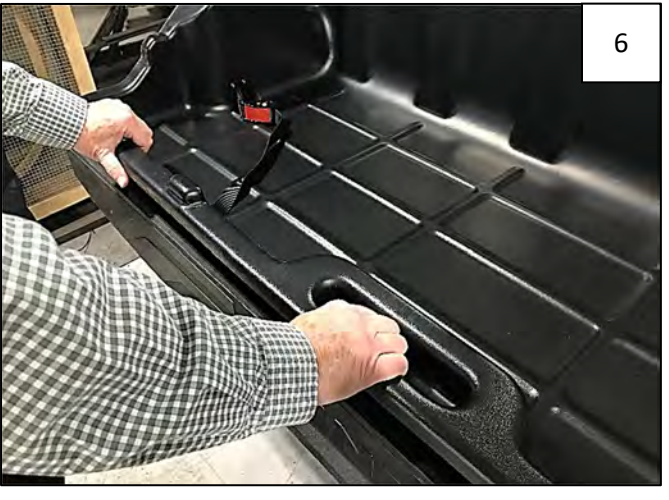
Position the Bed Storage Tray where you would like it in the bed/tail gate.