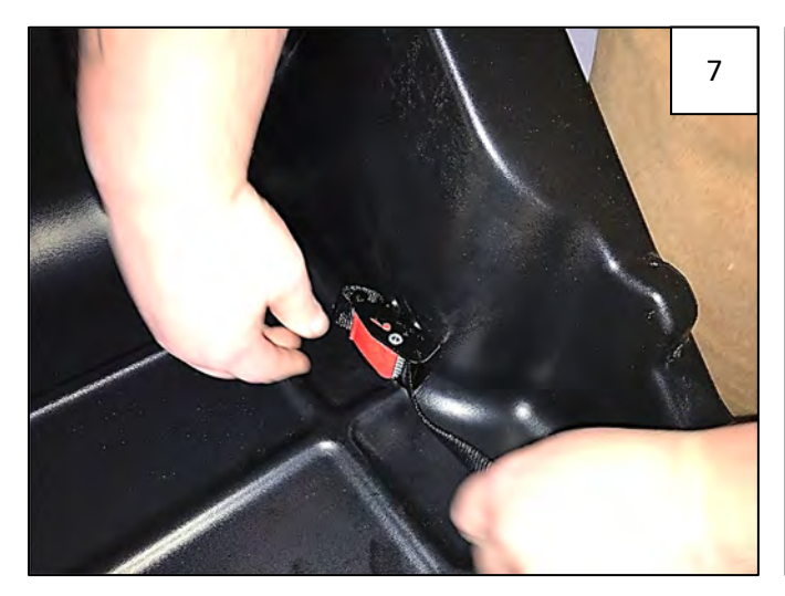
Tighten Straps while keeping Bed Storage Tray in position.