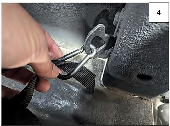
Clip a supplied Carabiner through the tie-down you have selected, then thread the Strap through the Carabiner. This will make it easy to remove the Tray when you need the