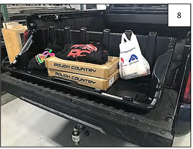
Use formed in features/slots around perimeter of Bed Storage Tray to hang bags and store many items in bed.