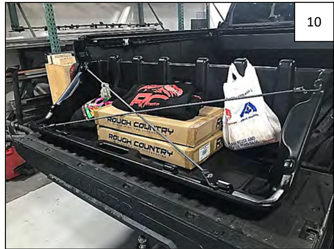
Criss-cross bungee cords to secure items.