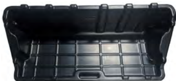
Bed Storage Tray 1 pc