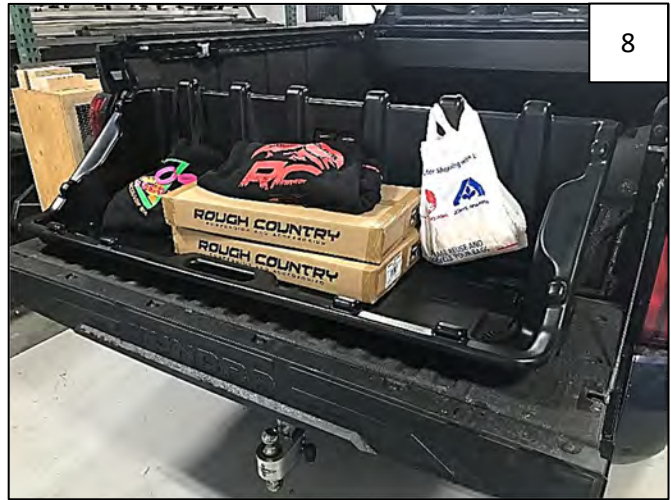
Use formed in features/slots around perimeter of Bed Storage Tray to hang bags and store many items in bed.