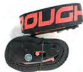
Strap 2 pcs