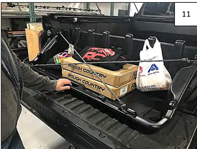
Slide tray back to close tail gate – tightened straps will keep tray from moving further into bed.