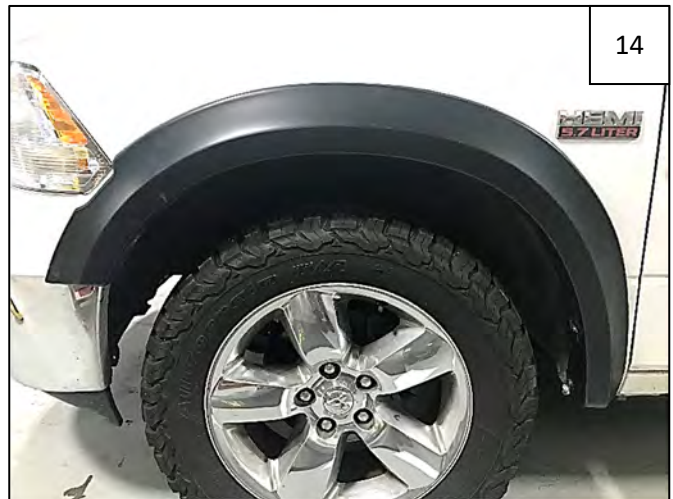
Install a supplied Truss Head Screw through fender flare and into clip installed in Step 10.