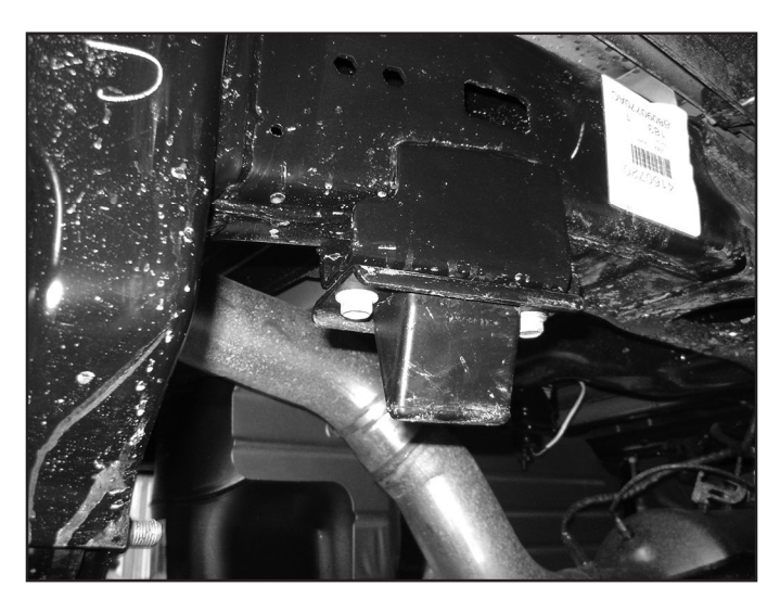
FIGURE 9A FIGURE 9B