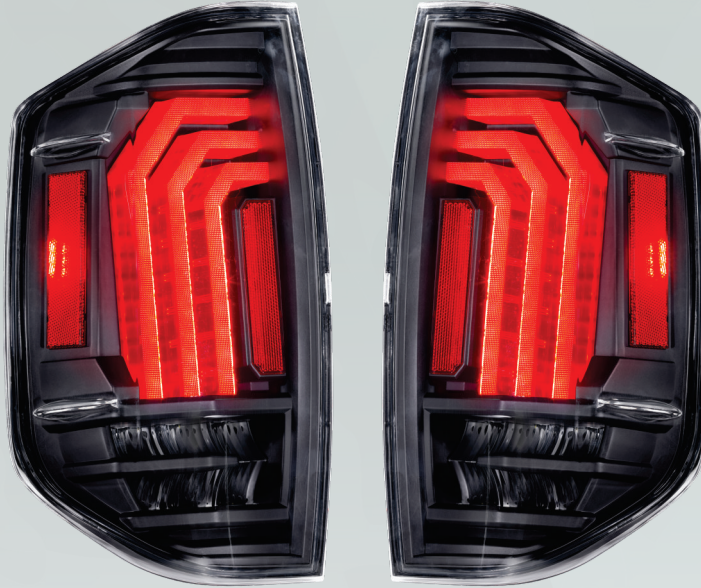
2X TAIL LIGHT ASSEMBLIES