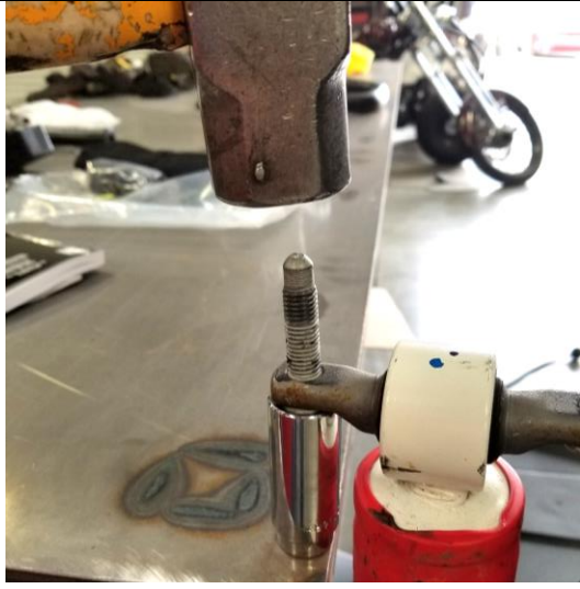
Figure 1: Remove OEM Studs.