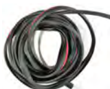
Wiper Style Edge Trim 360 inches