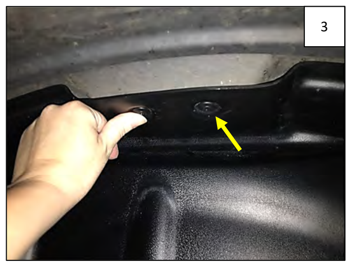
Install 2 supplied Plastic Retainers through top holes in Wheel Well Liner and into holes vacated in Step 1.