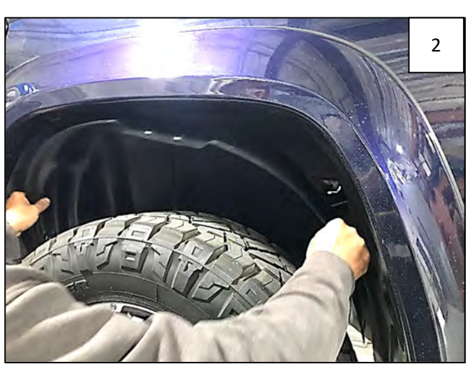
Slide the Rear Wheel Well Liner behind wheel at rear of vehicle. It is helpful to tilt the liner at a 45-degree angle at front of wheel and then straighten it out once it's behind the wheel.