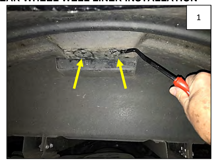
Use a pry tool or flathead screwdriver to remove 2 plastic retainers at top rear of wheel well.