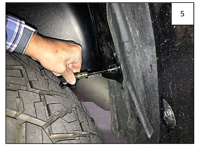
Use a 10mm socket to install a supplied 10mm Bolt through hole at rear of Wheel Well Liner and into factory grommet in existing wheel well liner.