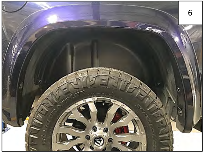
Tighten all screws. Installation is complete; repeat for other side.