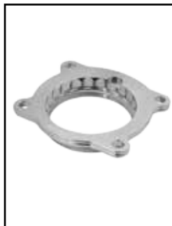
Throttle Body Spacer