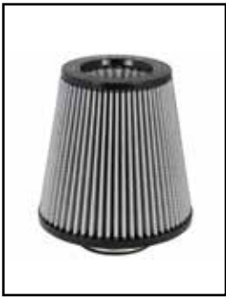
Pro DRY S Air Filter