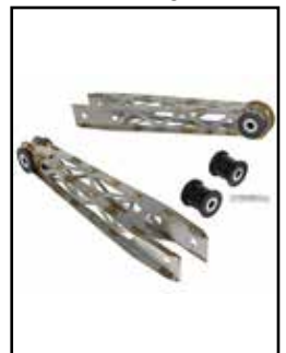
Rear Trailing Arms