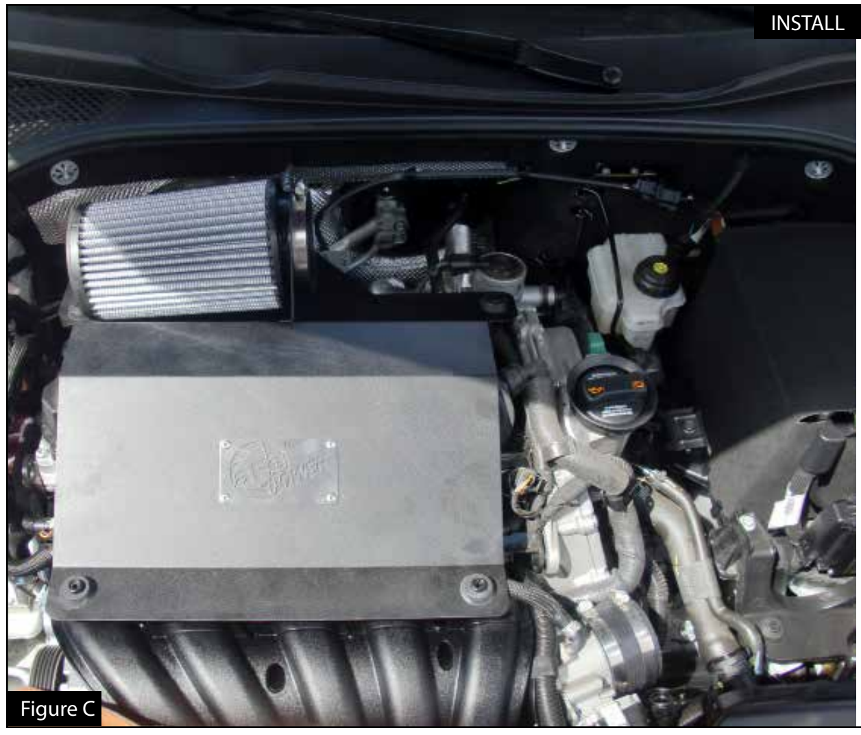
Refer to Figure C for Steps 7-8

Step 7: Install aFe filter onto the aFe housing along with trim seal. Make sure housing is sealed in filter retention groove.