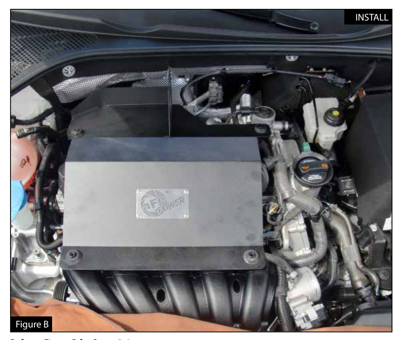
Refer to Figure B for Steps 5-6

Step 5: Transfer the OE grommets of the OE engine cover and install onto the aFe housing. Step 6: Install the aFe housing onto the OE mounting locations.