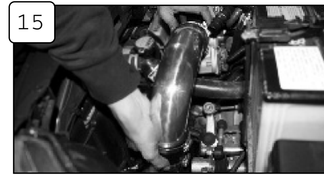
15 With 05-01005 coupler and clamps on throttle body install upper intake tube to vehicle and position to MAF sensor using 05-00418 coupler and clamps. Do not tighten.