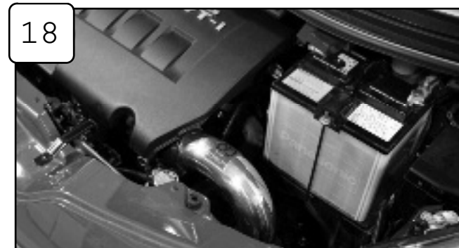
18 The installation of your Takeda performance intake is now complete. Please check all components and re-tighten if necessary. Thank you for choosing Takeda! NOTE: Place enclosed CARB EO sticker on or near the device on a smooth, clean surface. EO identification label is required to pass the smog inspection.