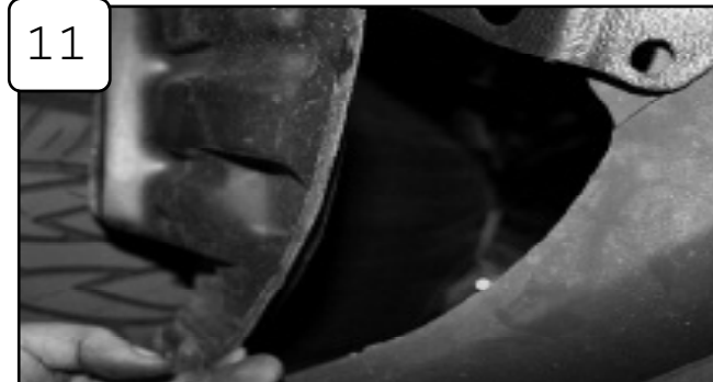
11 Secure front of vehicle on jack stands. Remove all driver side front plastic pins on bumper fender and inner fenderwell. Pull back cover enough to allow installation of cold air intake. Wheel removal is optional.