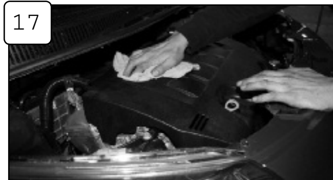
17 Install engine cover. Re-connect battery terminals. Re-secure plastic cover and pins from step 11.