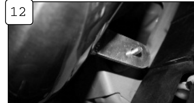
12 Install lower intake tube assembly into vehicle from bottom of vehicle and position lower tab to M6 isolation mount from step 8. Tighten using 10mm socket or wrench.