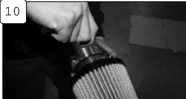
10 Install air filter and tighten using 5/16" nut driver. Attach pre-filter to filter.

For replacement part(s) or "Restore Kit" please log on to takedausa.com P.O. Box 1719 Corona CA, 92878