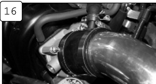
16 Position hole on coupler to fitting on crank case line and install to coupler. Tighten all clamps using 5/16" nut driver.