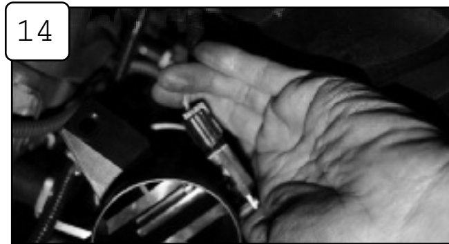
14 Re-connect MAF sensor harness.