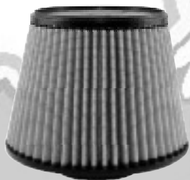
Replacement Filter P/N: TF-9009D