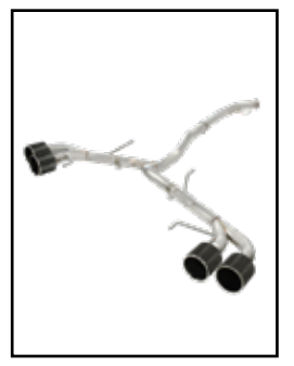
P/N: 49-36108-C (C/F Tips) 49-36108-P (Pol Tips)