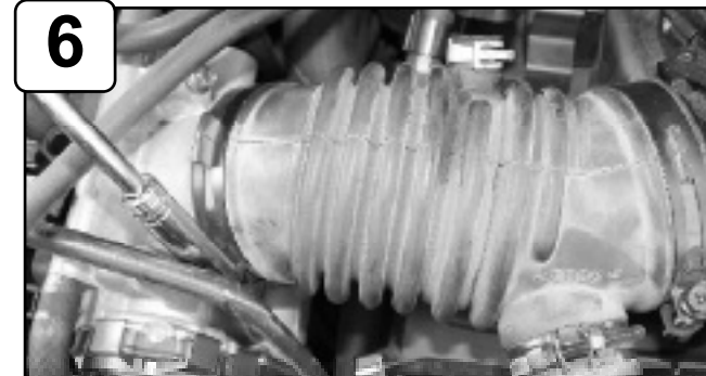
With 10mm socket or wrench loosen clamps on stock intake.