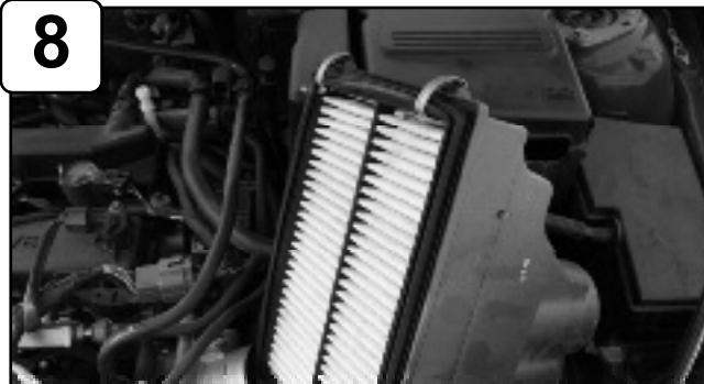
Remove bottom half of air box.