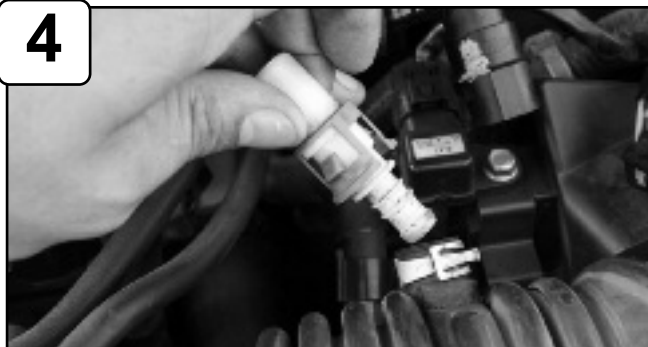
Disconnect Crank case line and remove plastic fitting. Save for later install ( See step 11 ).