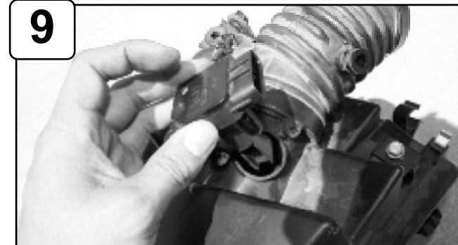
With phillips screwdriver, loosen and remove MAF sensor from stock air box.