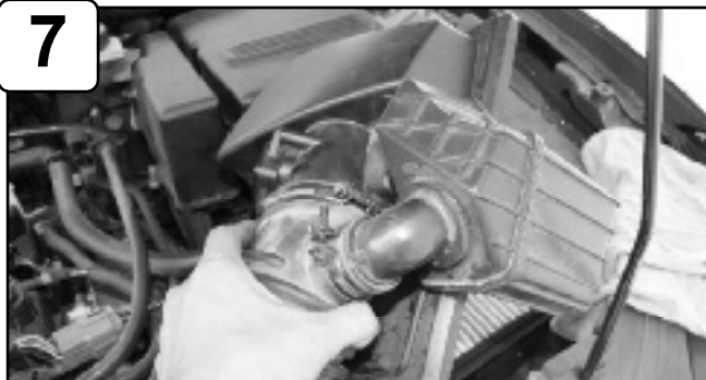
Lift and remove upper half of air box.