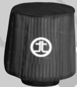
Pre Filter P/N: TP-7011B

Note: Filter Cleaning: When cleaning your Pro Dry S™ filter, be sure to use only "Restore Kit" (Takeda P/N: TP-7015C Pro Dry S™ cleaner only.)