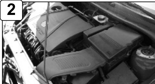
Complete Stock intake. Please disconnect battery terminals before installation.