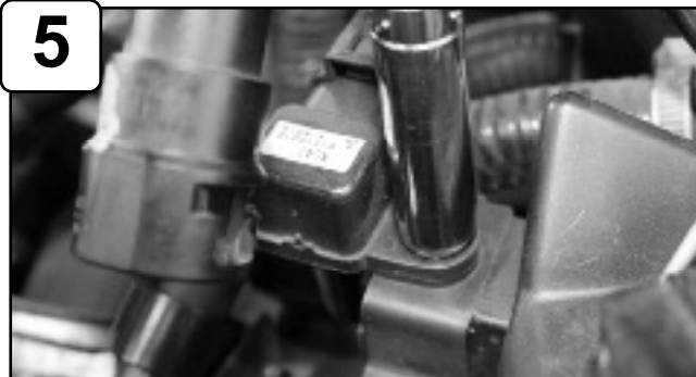
With 10mm wrench loosen VSV valve on air box, disconnect and remove. Save for later install ( See step 11 ).