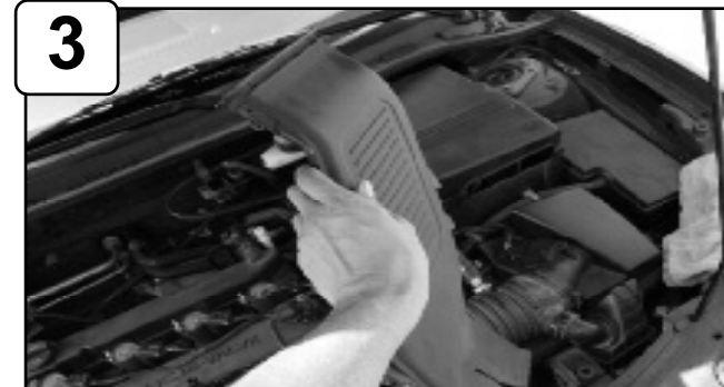
Remove plastic battery ram air.