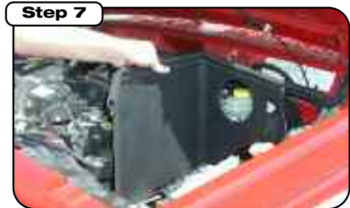
Prior to installing intake housing apply trim seal as shown to housing. Long piece to top edge and short piece lines hole. Place housing and mount. See step 8 for location(s).