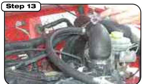
Connect supplied vent hose to nipple at intake tube and at breather vent tube and tighten clamps.