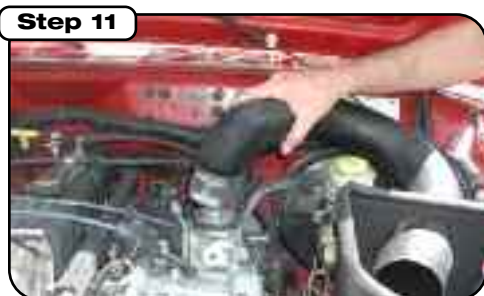
Slip coupler over throttle body.