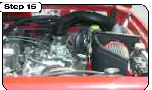
Place enclosed CARB EO sticker on a clean/smooth surface on or near the intake system. EO identification label is required in passing the Smog Check inspection. Make sure all hoses and clamps are tight and that all electrical components are secure.