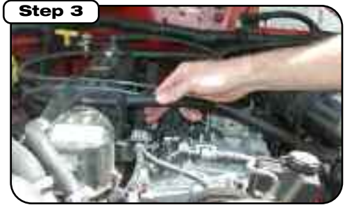
Remove breather tube from valve cover vent.