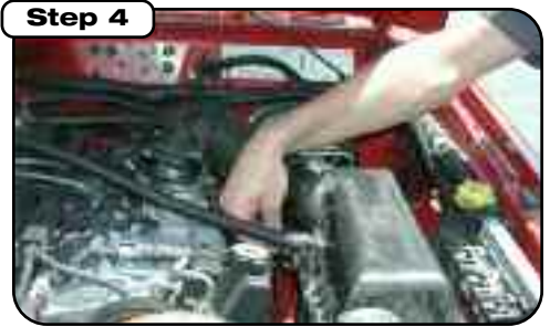
Remove top of OE air box.