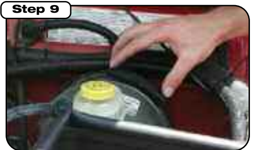
Looking straight at brake booster place center of isolation pad at 1 o'clock.