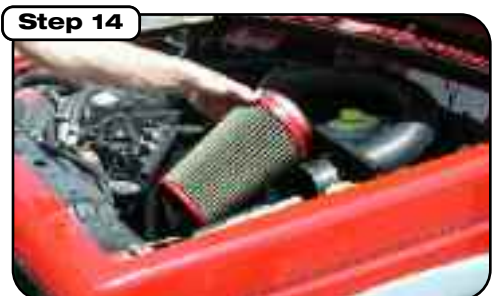
Install filter to intake tube and tighten clamp.