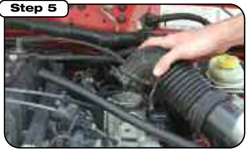
Loosen clamp at throttle body and remove.