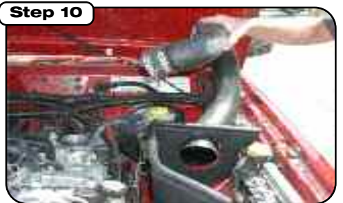
Attach coupler to intake at throttle body end. Then slide intake tube through filter housing starting with filter end of tube.