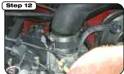
Install intake tube onto throttle body making sure tube is completely resting on throttle body to ensure proper hood clearance. Tighten clamps to secure tube.