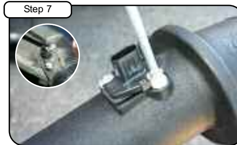
Step 7 With T-20 torx bit remove MAF sensor and ( with gasket, nylon spacers and screws provided ) install into new tube. Make sure gasket and nylon spacers are between sensor and tube.