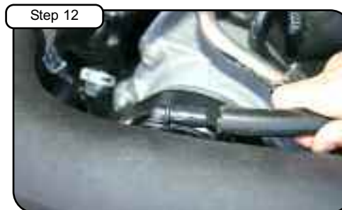
Step 12 Install new 3/8" hose provided to valve cover side and new tube side.