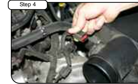
Step 4 Disconnect MAF sensor harness.