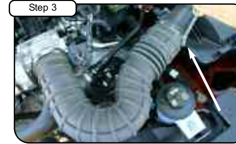
Step 3 Loosen the clamp at air box side and remove OE intake tube.