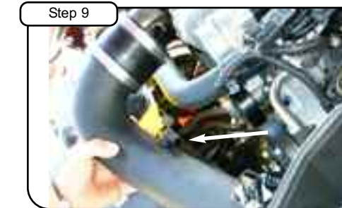
Step 9 Install coupler with clamps to tube. Also install grommet with elbow fitting to tube. Install tube to outside of housing and position coupler on to throttle body.