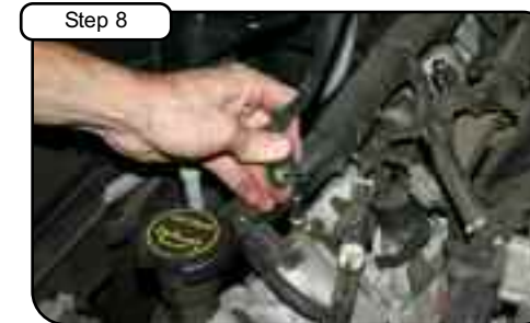
Step 8 Remove factory crank case line from engine.