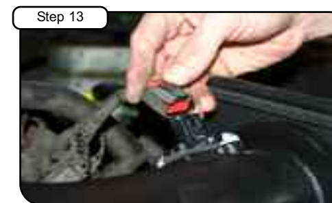
Step 13 Reconnect MAF sensor harness.