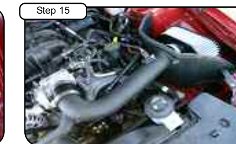
Step 15 Place enclosed CARB EO sticker on a clean/smooth surface on or near the intake system. EO identification label is required in passing the Smog Check Inspection. Your installation is now complete. Please check all bolts and clamps periodically. Re-tighten if necessary. Thank you for choosing aFe!

Note: Filter Cleaning and Re-oiling: When cleaning your aFe filter, be sure to use only aFe's "Restore Kit" (aFe P/N: 90-50001 blue oil aerosol, or aFe P/N: 90-50501 blue squeeze bottle oil) Filter Replacement: Magnum FLOW PN: 24-90025 (black w/blue media) or Pro Dry S™ P/N 21-90025 (black w/white media) Pro Dry S™ cleaning: see cleaning instruction sheet 06-00074