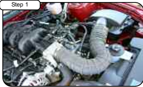
Step 1 Complete Stock Intake.