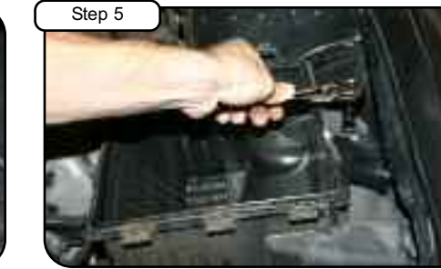
Step 5 With 10mm socket or wrench loosen the 2 screws holding in OE air box. Lift up and remove OE air box out of vehicle.