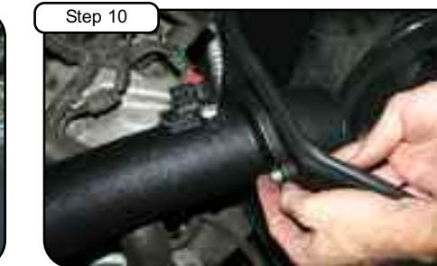
Step 10 Install screws/nuts and washer provided to mount tube to housing. Tighten using 10mm socket or wrench.