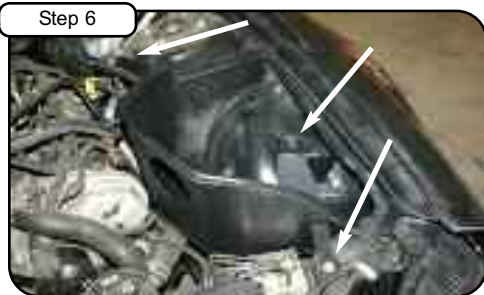
Step 6 With OE screws removed from step 5, install new aFe housing to vehicle. Tighten using 10mm socket or wrench.