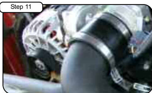
Step 11 Tighten clamps with 5/16" nut driver.