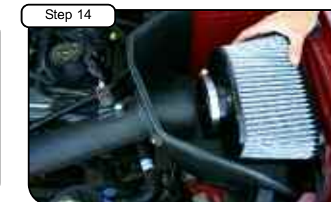
Step 14 Install air filter and tighten using 5/16" nut driver.