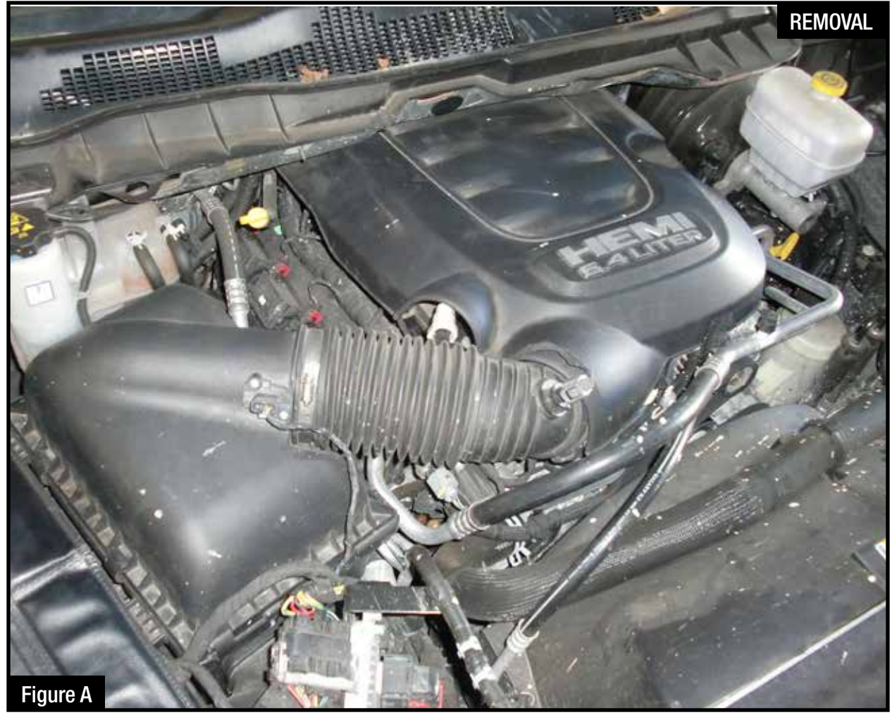
Refer to Figure A for Step 1

Step 1: Remove the engine cover by lifting on front of the cover to release the front mounting points and then pulling straight forward towards the front of the truck to unclip the rear mounting points.