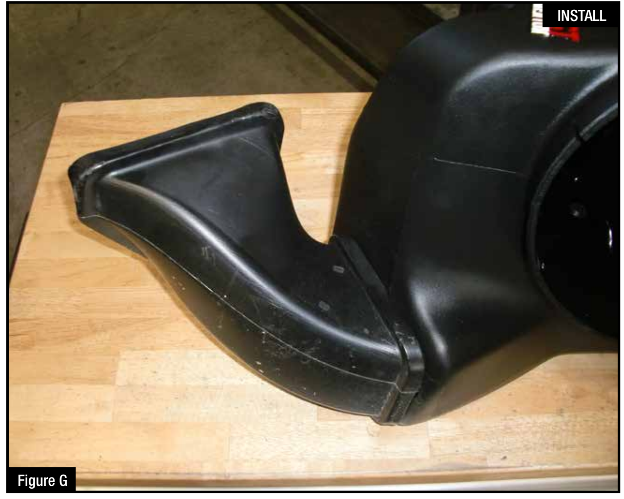
Refer to Figure G for Step 17

Step 17: Connect the factory air duct to the new aFe air box as shown.