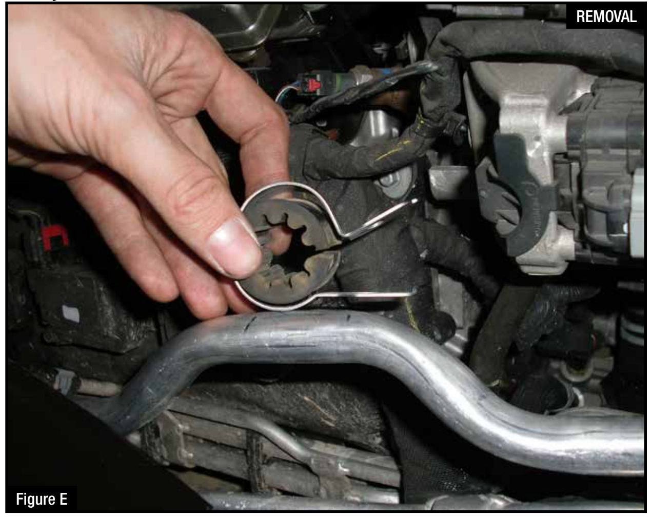
Refer to Figure E for Step 13

Step 13: Remove one of the isolation mounts from the AC line.