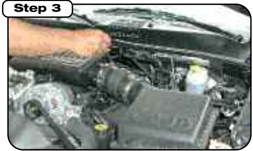
Loosen clamp at air resonator box and remove top half of filter box.