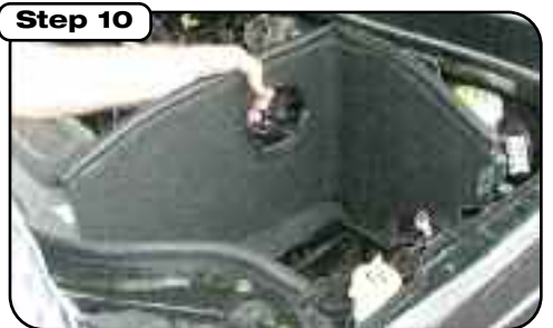
Before installing housing, apply large trim seal to top of housing and small trim seal to tube inlet. Install filter housing using supplied hardware on lower mounts.