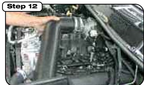
Thread filter end of housing through opening in filter housing first, then slip coupler over throttle body. Tighten clamps at throttle body.