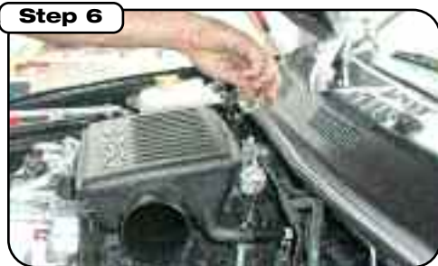
Loosen clamp at throttle body and remove resonator box.