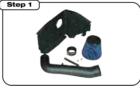
Complete kit with parts.