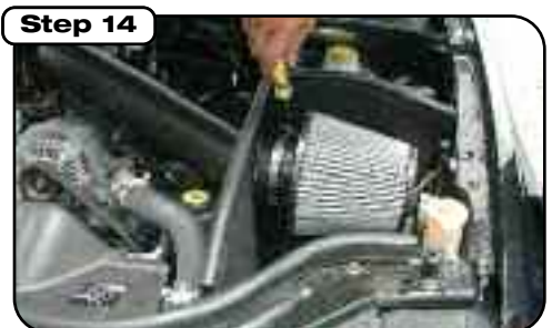
Install filter to intake tube and tighten clamp.