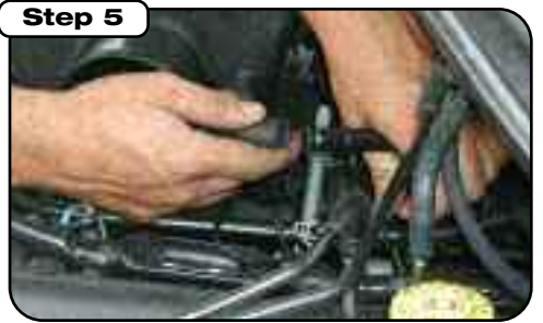
Remove vent hose at tubing coupler.