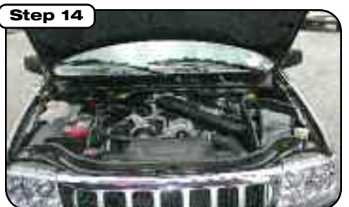
Place enclosed CARB EO sticker on a clean/smooth surface on or near the intake system. EO identification label is required in passing Smog Check inspection. Make sure all hoses and clamps are tight and that all electrical components (if applicable) are secure. Check and retighten connections and filter after a few hours of operation.