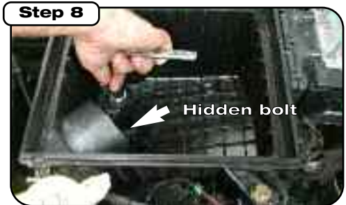
Remove four bolts from lower half of air box. Note: There's a bolt hidden underneath airbox inlet tube. You must use an open end wrench or adjustable wrench to remove.