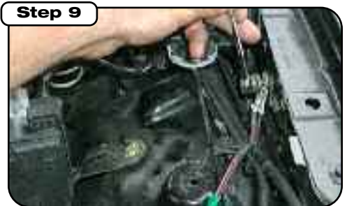
Remove ground strap at inner driver-side fender-well. (Keep bolt for installing filter housing.)