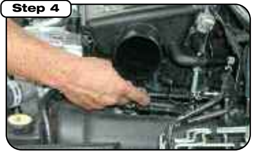
Unbolt resonator at manifold (Two bolts, opposite sides).