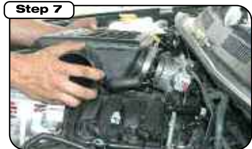
Loosen clamp at throttle body and remove resonator box from throttle body.