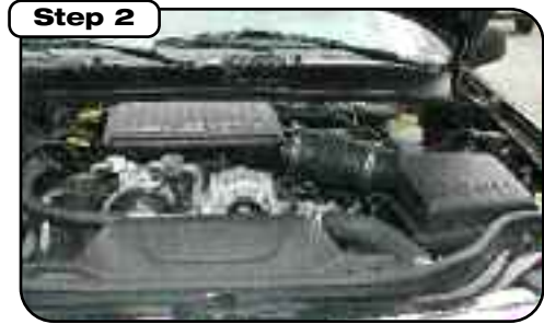
Complete stock intake.