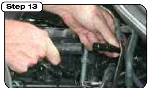
Connect supplied vent hose to nipple at intake tube and at breather vent tube. Note: no clamps are required.