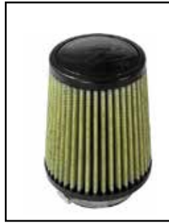
Pro GUARD 7 Air Filter