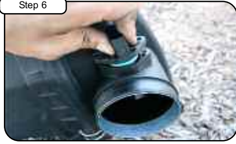
Remove MAF sensor from stock air box using T20 torx bit.