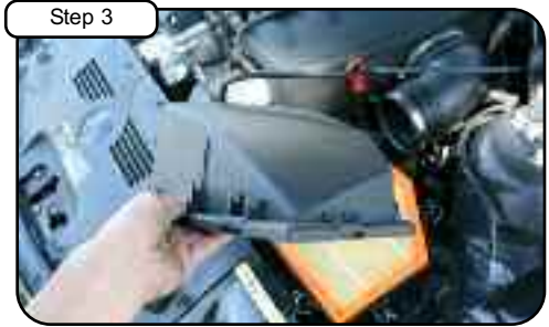
Unclip upper half of air box and lift carefully.