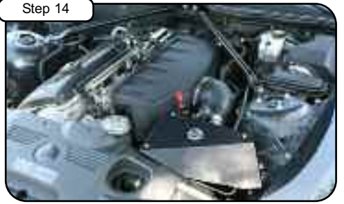
Place enclosed CARB EO sticker on a clean/smooth surface on or near the intake system. EO identification label is required in passing the Smog Check inspection. Your installation is now complete. Please check all bolts and clamps periodically. Re-tighten if necessary. Thank you for choosing aFe!

Note: Filter Cleaning and Re-oiling: When cleaning your aFe filter, be sure to use only aFe's "Restore Kit" (aFe P/N: 90-50001 blue oil aerosol, or aFe P/N: 90-50501 blue squeeze bottle oil). Filter Replacement: Pro-5R™ PN: 24-91021 (black w/blue media). Pro Dry S™ P/N: 21-90044 (black w/white media) Pro Dry S™ cleaning: see cleaning instruction sheet 06-00074. For replacement part(s) or "Restore Kit" please call aFe sales/tech support @ 951-493-7100