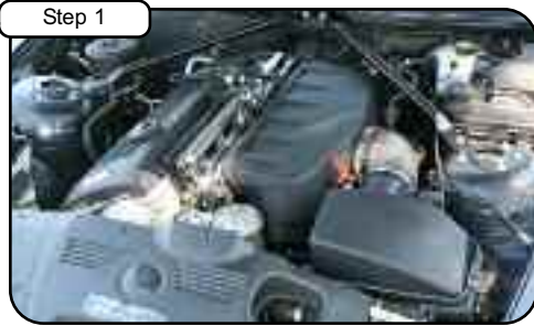
Complete Stock Intake.

advanced FLOW engineering™ P.O. Box 1719 Corona, CA 92878 Support: 951-493-7100 www.aFePower.com