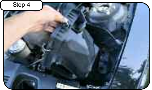
Pull and lift air box out of vehicle.