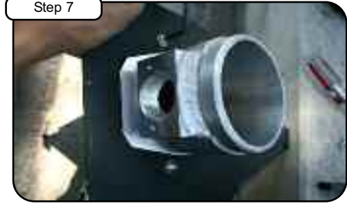
Install filter adaptor to housing using 4 button head screws & wavy washers. Tighten using 5mm allen key.