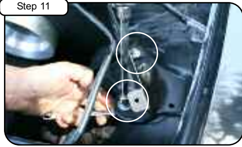
With screws, washers and nuts provided, place through holes from step 5. Tighten using 10mm socket or wrench.