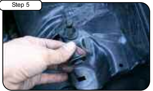
Turn and remove air box clips out of vehicle.