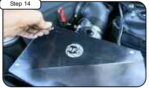
Install cover using button head screws provided and tighten using 5/32" allen key. Re-connect MAF sensor harness.