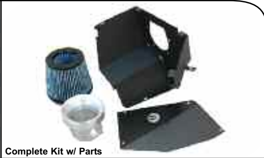
Complete Kit w/ Parts

advanced FLOW engineering™ P.O. Box 1719 Corona, CA 92878 Support: 951-493-7100 www.aFePower.com