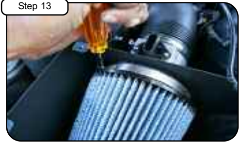
Install air filter and tighten using 5/16" nut driver. Tighten clamps on intake tube using 1/4" nut driver.