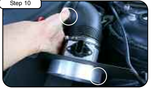
Loosen clamp on plenum box and position to new adaptor. Do not tighten.