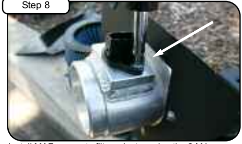
Install MAF sensor to filter adaptor using the 2 M4 screws provided and tighten using flat head screwdriver.