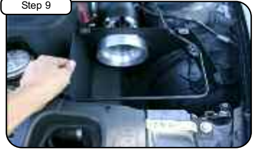
Install housing into vehicle.