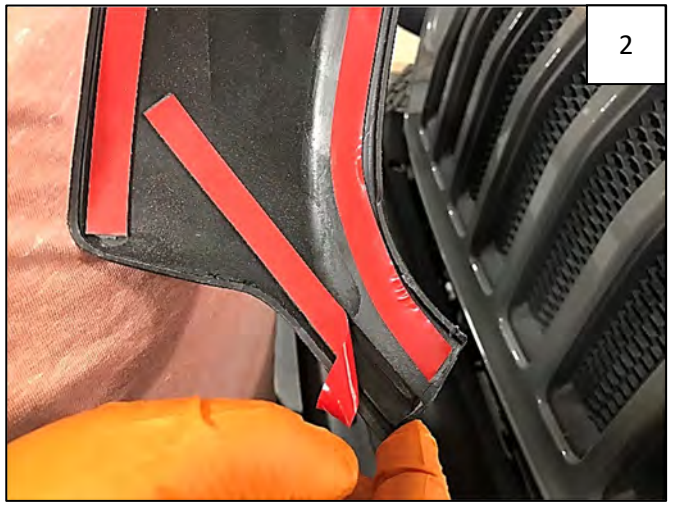
Peel 2-3 inches of red tape leader from each piece of tape and fold around to the front of the part (for long tape it is helpful to peel from both ends). NOTE: it is helpful to use masking tape to hole leaders in place on front of part.

Open hood and prop slightly ajar with a wood block.