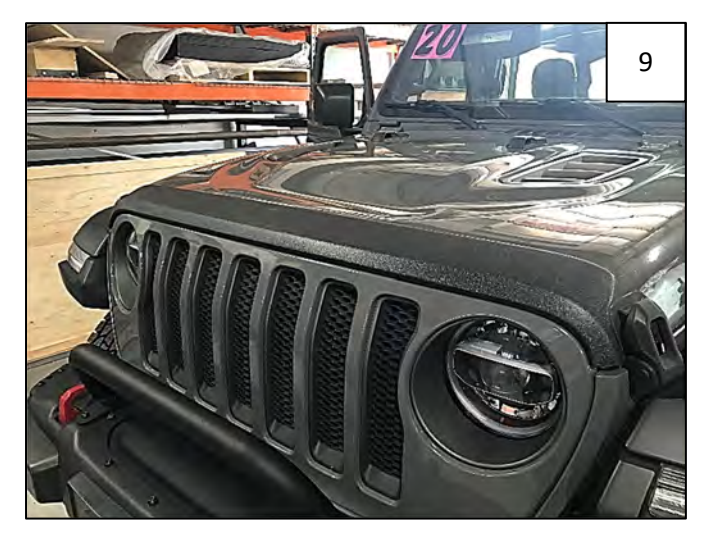
Completed Hood Protector Installation.