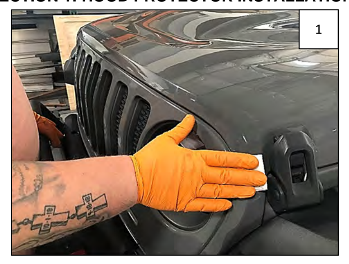
Use supplied alcohol wipe to clean hood at areas of tape. Alternately: Clean area with alcohol or degreaser.

Open hood and prop slightly ajar with a wood block.