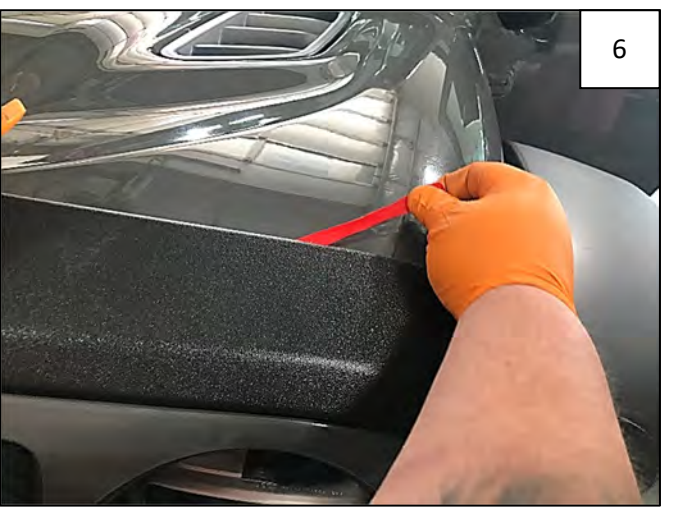
Pull rest of tape leaders in numbered order in Step 3. Carefully pull red tape leader at a 45-degree angle up away from the part to release from the tape, pressing against part as you go.