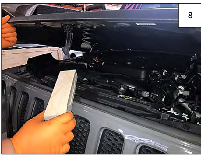
Remove block from under hood and close/latch hood.