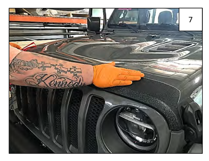
Press part against vehicle at areas of tape for 30 seconds to ensure full adhesion. Tape cures after 24 hours at 65 degrees. Curing will take longer in colder temperatures.