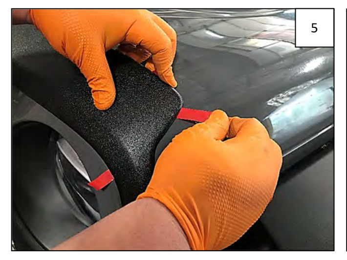
After pulling a few inches of tape leader #1, press part firmly at area of tape before proceeding, to maintain part position.