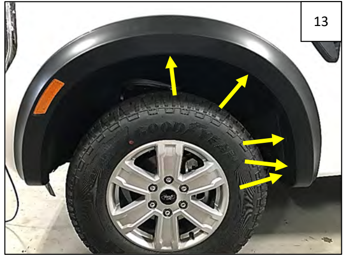
Holding flare firmly on fender, install 5 supplied Small Christmas Tree Fasteners through holes indicated by arrows.