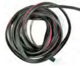
Wiper Style Edge Trim 330 inches