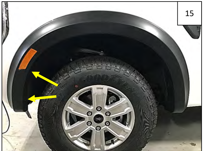
Install 2 supplied Large Christmas Tree Fasteners at front of flare.