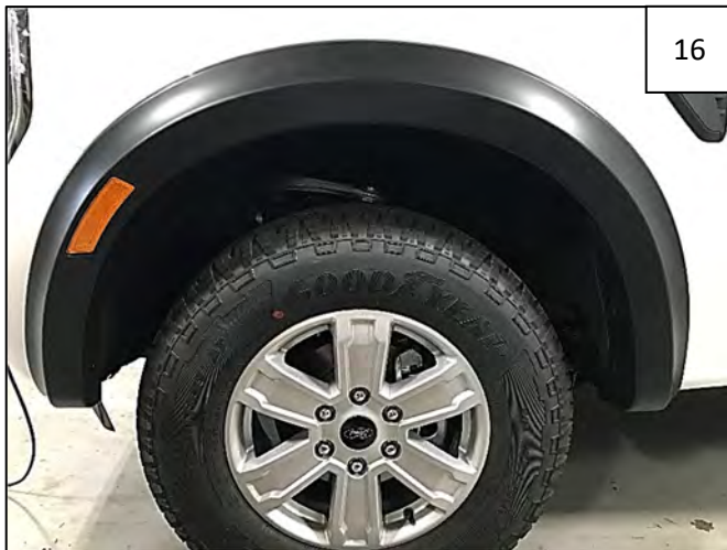
Completed Front Flare Installation.