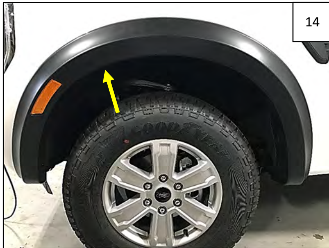
Install 1 supplied Plastic Push-Lock Retainer through hole indicated by arrow.