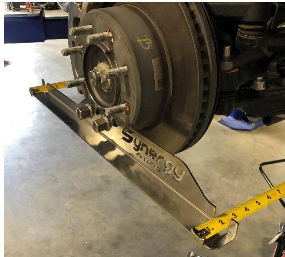
Figure 4. Hook Side of Tape Measure Placed in Slots