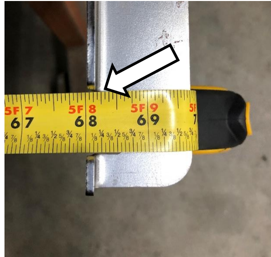
Figure 6. Looking Down over the Vertical Face of the Aid