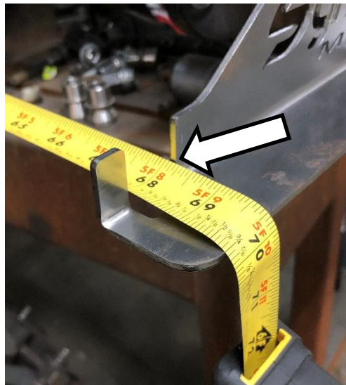
Figure 7. Side View of Vertical Face