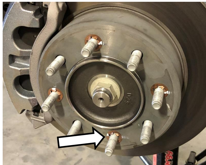
Figure 1. Rotor washer that needs to be removed.