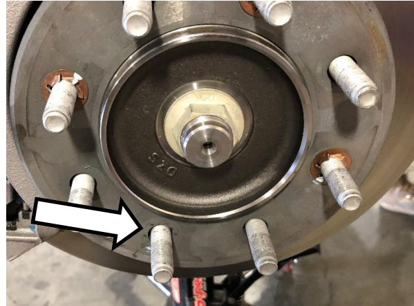
Figure 2. Rotor Washer Removed for Steering Alignment Aid