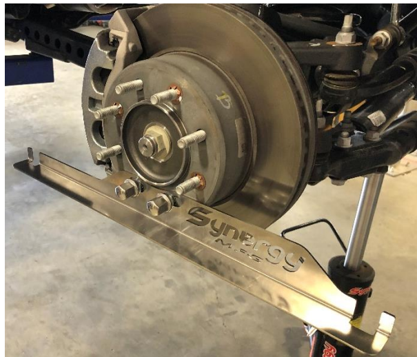
Figure 3. Steering Alignment Aid Installed for Use