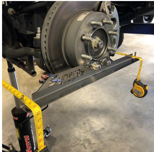
Figure 5. Roll Side of Tape Measure Placed in Slots